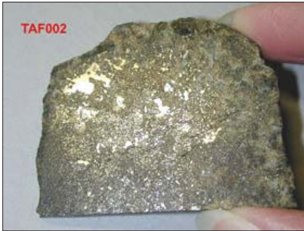
The cut face of the end section showing much metal and the unusual texture of Tafassasset.