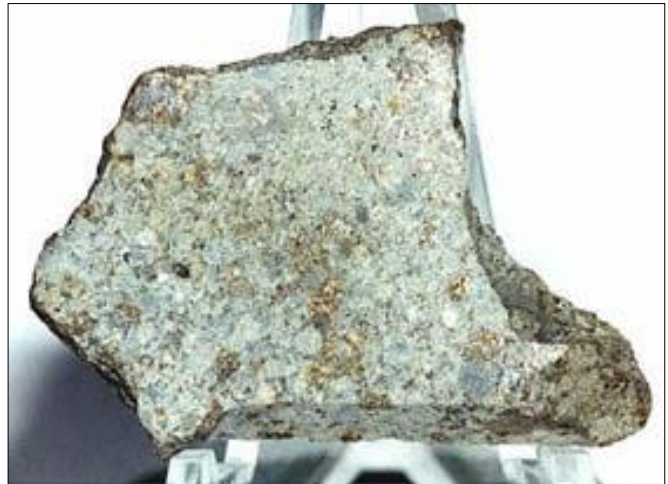
My Tabor: 4.7 gram polished partial slice

“Before my great grandparents immigrated to the US more than a century ago, they lived in the Czech town of Tabor. I can only hope and imagine that my distant ancestors watched in awe as the Tabor meteorite fell to earth.”