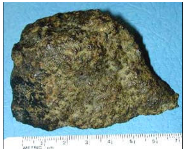
A 186 gram end section of the carbonaceous chondrite called Tafassasset.

This is no longer true. The largest piece, weighing about 30 kilos, has finally been cut, and it is not a Tafassasset! Although it is a meteorite.